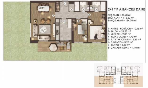
ZEMİN KAT PLANI