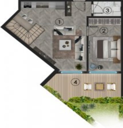
BAHÇE DUBLEKS DAİRE ALT KAT GARDEN DUPLEX APARTMENT GROUND FLOOR