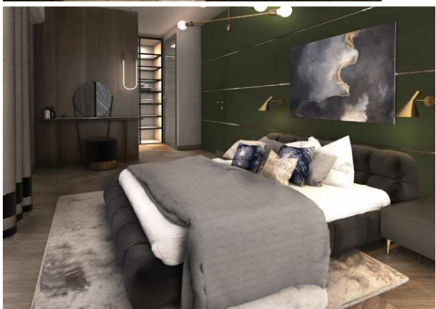
FLAMİNGO GÖL EVLERİ / C BLOK