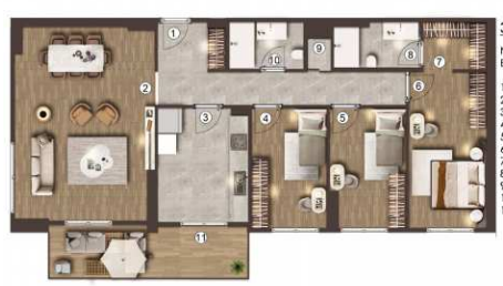
3+1 TİP E DAİRE

NET ALAN = 113,00 m<sup>2</sup> BRÜT ALAN = 163,70 m<sup>2</sup>