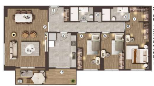
3+1 TIP E DAIRE

ANTRE + KORÍDOR = 13,55 m² - SALON = 30,30 m² - MUTRAK = 11,60 m² - YATAK ODASI = 10,00 m² - YATAK ODASI = 10,00 m² - YATAK ODASI = 10,90 m² - CHANDORSI = 3,45 m² - E, BANYO = 4,00 m² - C, ODASI = 0,55 m² - BANYO = 3,70 m²