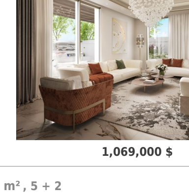
359 m<sup>2</sup>, 5 + 2 For Sale, Villa (3)

300 m<sup>2</sup>, 5 + 2 For Sale, Villa (7)