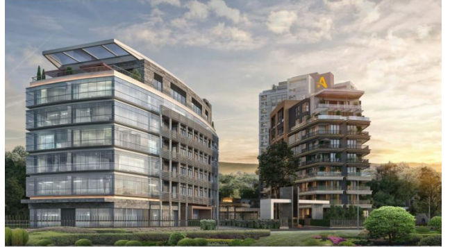
AVRUPA KONUTLARI SAKLIVADI PROJESİ