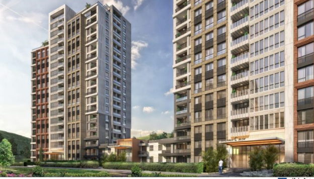
AVRUPA KONUTLARI SAKLIVADI PROJESİ