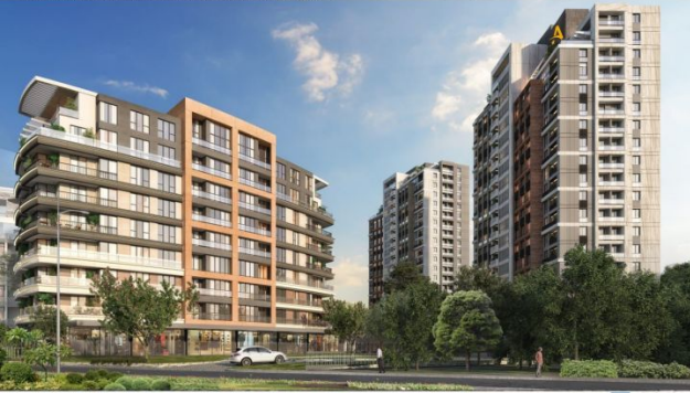
AVRUPA KONUTLARI SAKLIVADI PROJESİ