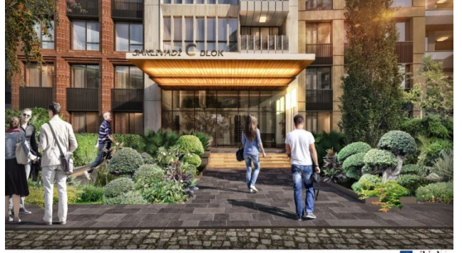
AVRUPA KONUTLARI SAKLIVADI PROJESİ