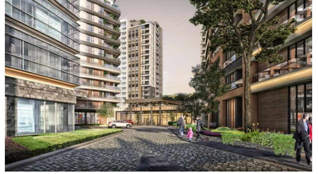
AVRUPA KONUTLARI SAKLIVADI PROJESİ