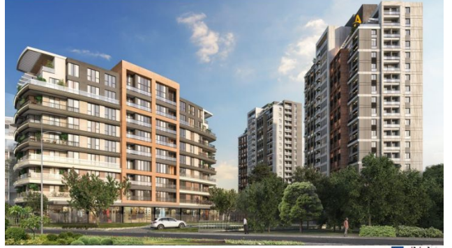
AVRUPA KONUTLARI SAKLIVADI PROJESİ