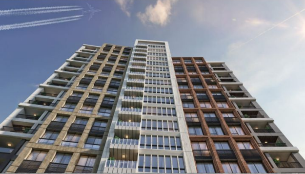
AVRUPA KONUTLARI SAKLIVADI PROJESİ