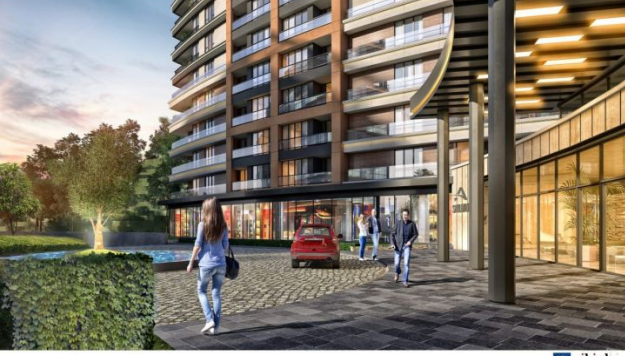
AVRUPA KONUTLARI SAKLIVADI PROJESİ