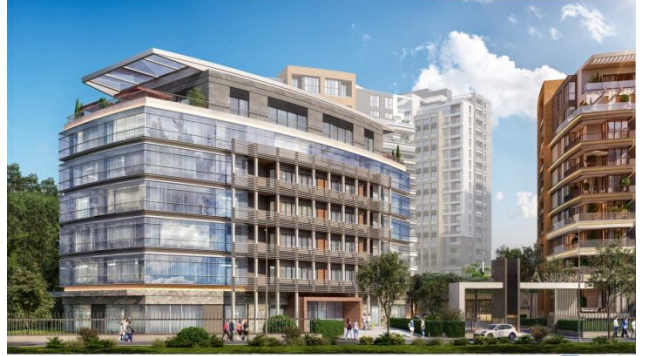
AVRUPA KONUTLARI SAKLIVADI PROJESİ