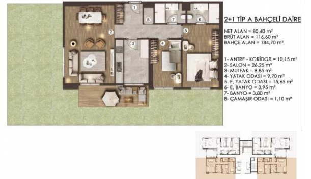
ZEMİN KAT PLANI